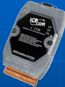
Profibus to RS 232/ 422/ 485