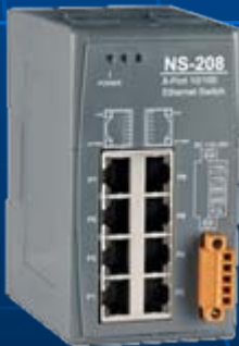
8 port Switch