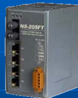
One Pair Fiber Optic Switch