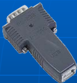
RS 232 to USB