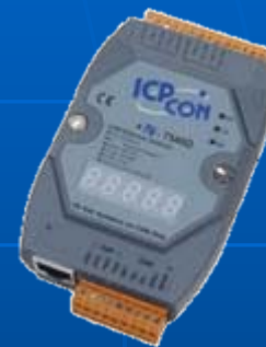
CAN to Ethernet

For more information, visit http://www.icpdas-usa.com/can_communication_converters.html