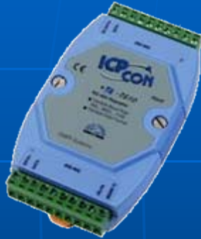
RS 422/ 485 repeaters