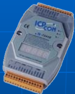
DeviceNet to DCON