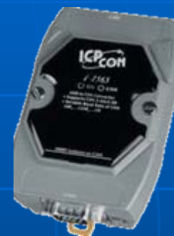
USB to CAN

For more information, visit http://www.icpdas-usa.com/serial_to_usb_converters.html