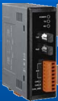
CAN to Fiber