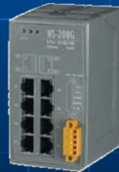
Giga bit Switch