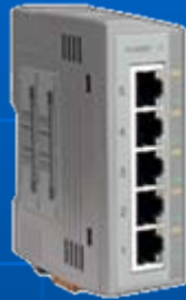
5 port Switch