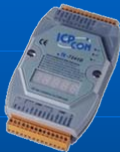
DeviceNet to Modbus RTU