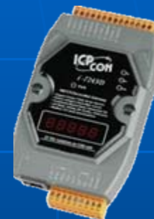
DeviceNet Master to Modbus TCP

For more information, visit http://www.icpdas-usa.com/devicenet_gateway.html