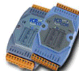
Data Acquisition Modules