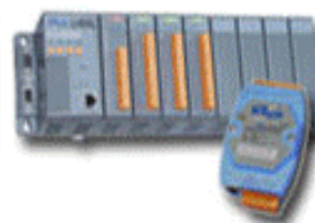
Embedded / PLC Controllers