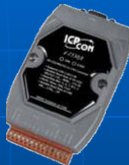
RS 232 / 422 / 485 to CAN