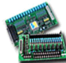
PCI / ISA Data Acquisition Boards