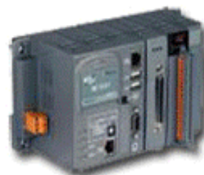
Programmable Automation Controllers