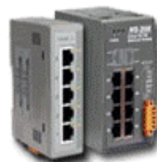
Industrial Data Communications