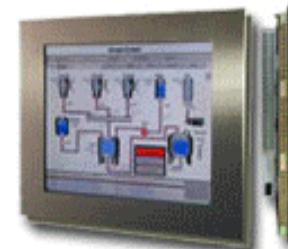
Industrial Touch LCD Monitors