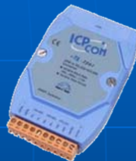
Multiple RS 485 ports to USB