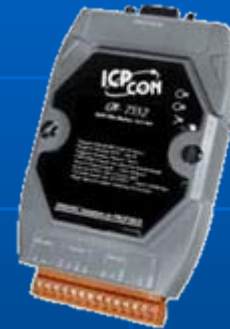
Profibus to Modbus

For more information, visit http://www.icpdas-usa.com/profibus_gateway.html