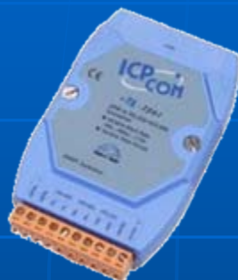
RS 232/ 422 /485 to USB