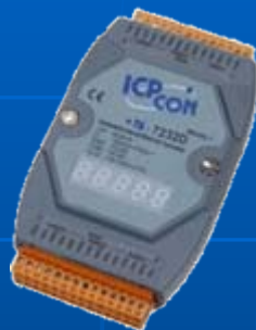
CanOpen to Modbus