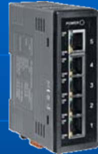
Giga bit Switch