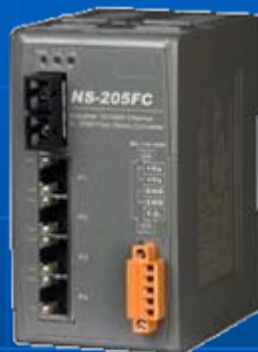
Un-Managed Switch with Multi mode or Single Mode and FC and FT Connector selections