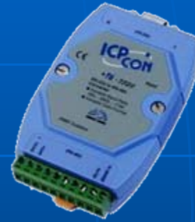
RS 232 to RS 485, RS 232 to RS 422 / 485 Converters

For more information, visit http://www.icpdas-usa.com/rs_232_422_485_conversion_devices.html