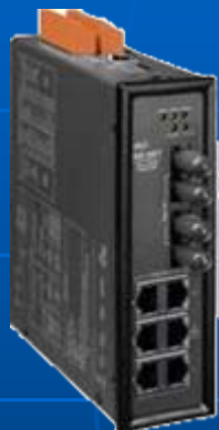
Managed Fiber Optic Switch